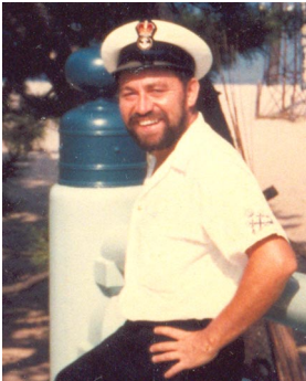
THEN Miyazu 1968

the return from the Far East of HMS Caprice which I rejoined in 1967.