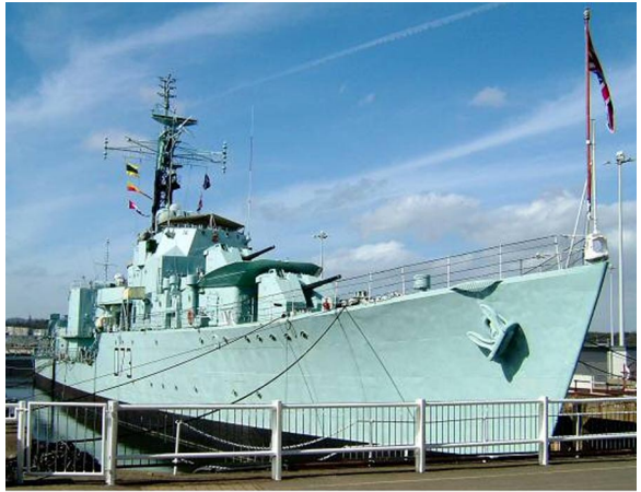
HMS Cavalier - now preserved at Chatham

Members attending the Chatham Reunion in 2000 had a very nostalgic trip around the ship, but a lot more work has been done since then and it is hoped that machinery spaces may be open to the Public soon.