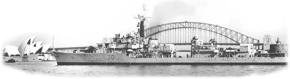
HMS CAPRICE entering Sydney 1968